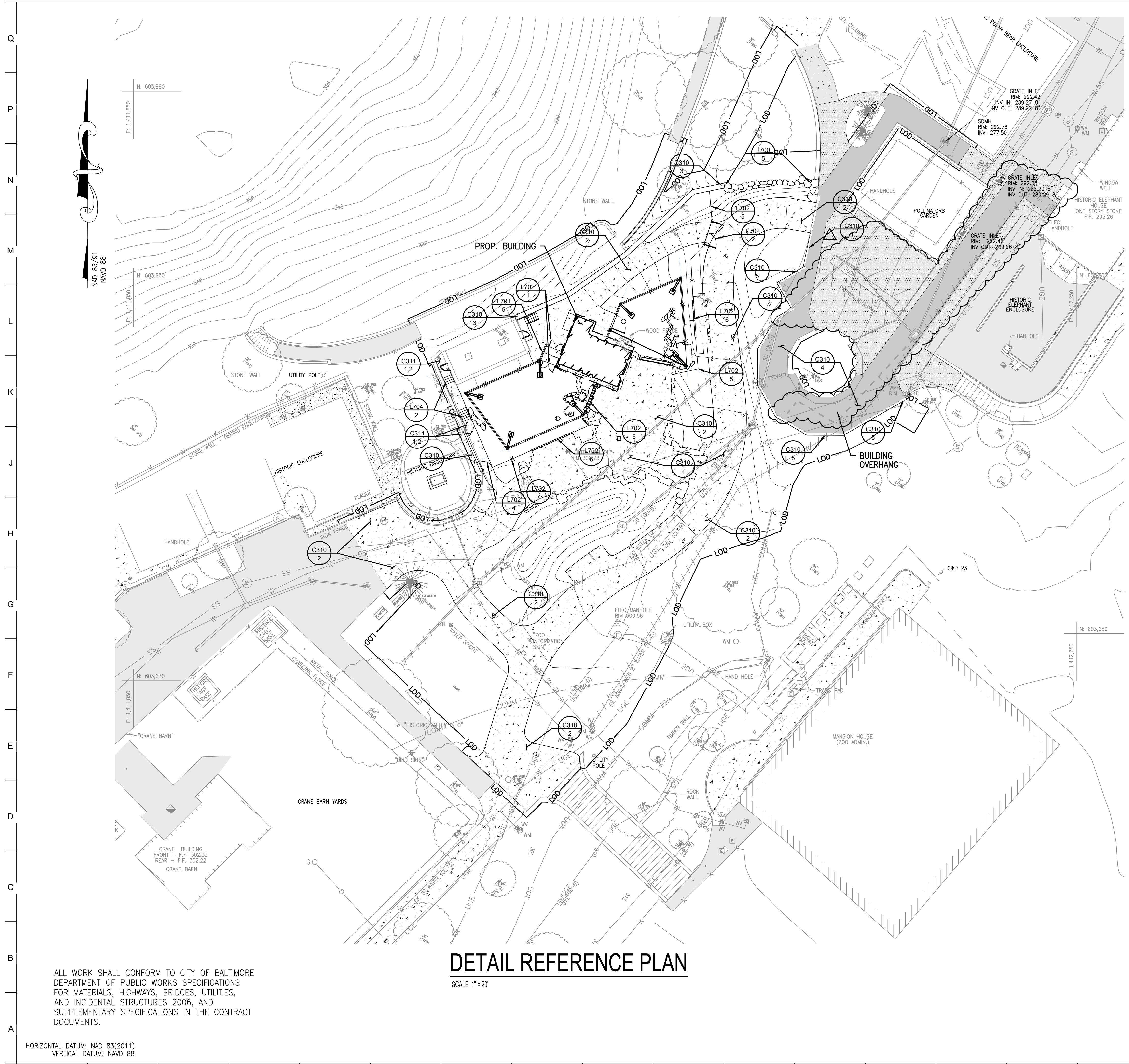
DETAIL REFERENCE PLAN SCALE: 1"=20'